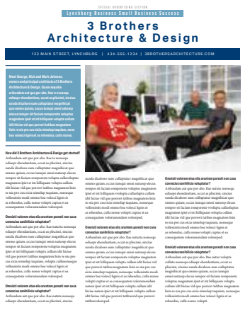
Full Page Sample